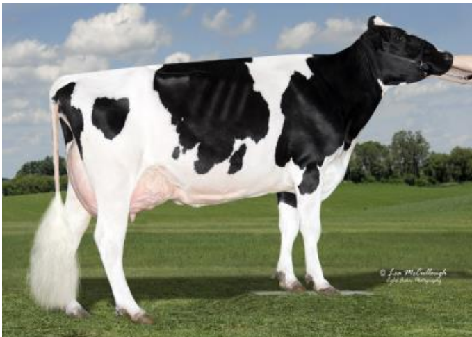
MGD: OCD Planet Danica-ET