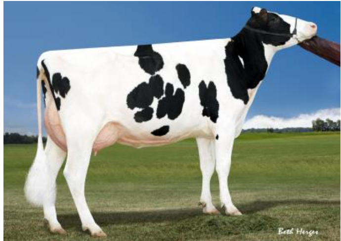
Dam: Miss Ocd Robst Delicious-ET

Sire: De-Su Nominee-ET Dam: Miss Ocd Robst Delicious-ET VG-87 GMD DOM 02-05 2x 365d 33780m 3.3 1121f 3.1 1047p MGS: Roylane Socra Robust-ET TR TV TL TD MGD: OCD Planet Danica-ET EX-93 DOM 03-01 3x 365d 39240m 3.5 1384f 3.0 1166p MGGs: Ensenada Taboo Planet-ET TR TV TL TY TD EX-90 MGGD: Miss Elegant Delight-ET VG-88 DOM 02-02 3x 305d 27850m 3.4 958f 2.9 803p