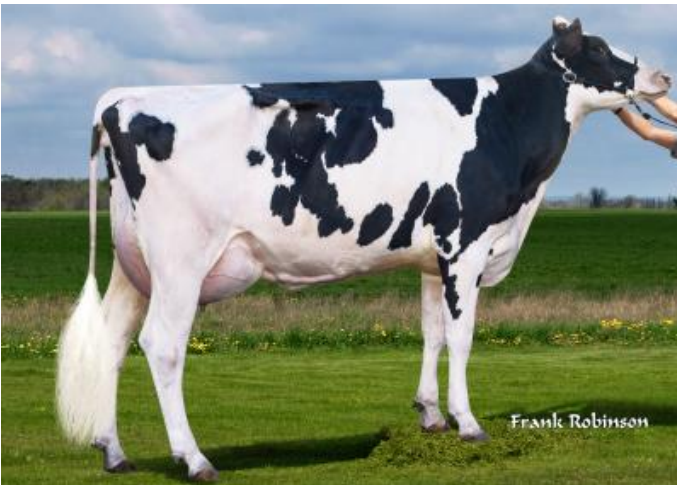
Daughter: ST Gen 79345-ET