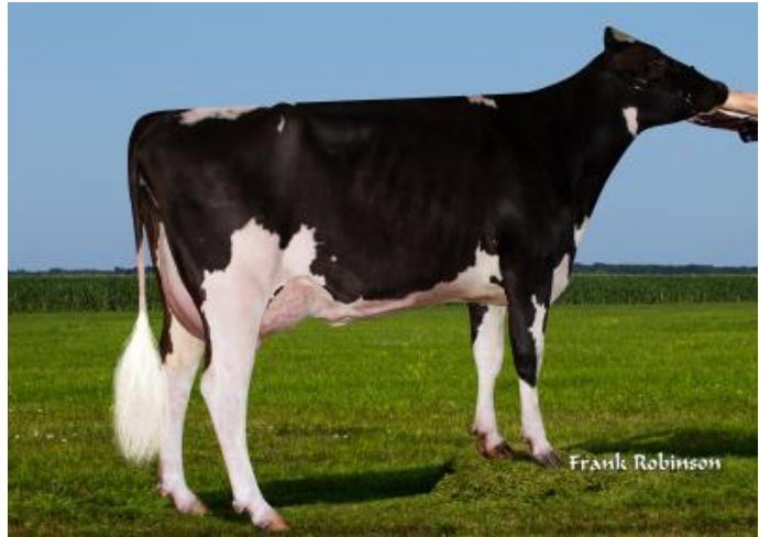
Daughter: ST Gen 82172

Sire: Mr Mogul Delta 1427-ET Dam: Wilra Super Sire 608-ET VG-85 02-01 2x 305d 30420m 3.6 1109f 3.2 972p MGS: Seagull-Bay Supersire-ET TV TL TY TD MGD: Wilra Shamrock 294-ET 03-04 3x 305d 29730m 4.4 1319f 3.1 919p MGGS: Ladys-Manor PI Shamrock-ET TR TV TL TD VG-85 MGGD: Wilra Massey 997 BY 03-11 3x 305d 31700m 4.0 1280f 3.2 1018p