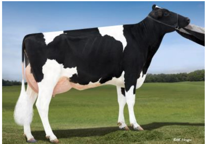
Dam: Wilra Super Sire 608-ET